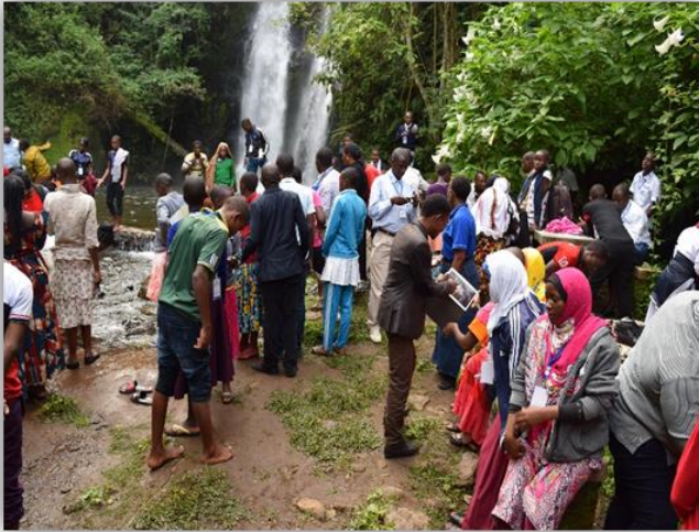
Workshop participants enjoying the beauty of nature at Marangu Falls in Moshi.

This workshop had other outdoor Programs that aimed at enriching the attendees' knowledge of our country's endowment. The participants had a privilege of visiting the Marangu Water Falls at Kinukamori site as part of educational study tour. This was indeed a great experience for all of the participants!