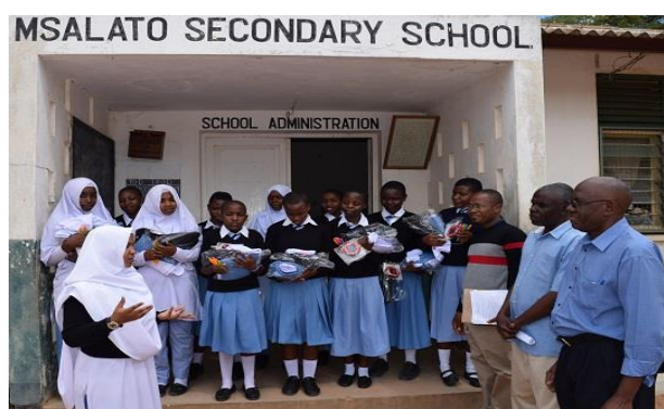
MVC representative from Msalato Secondary school appreciating the support received after distribution of scholastic materials.