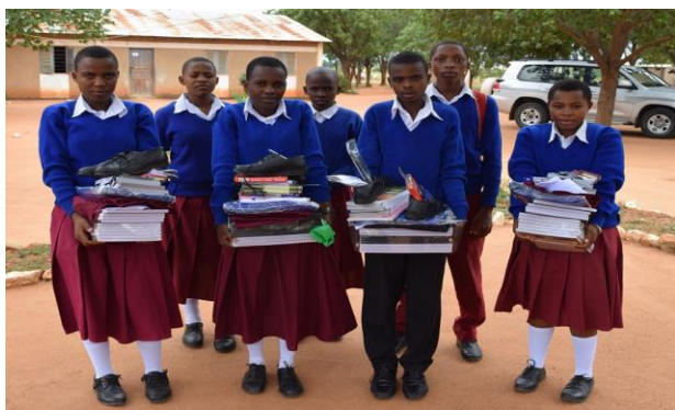
MVC from Chamwino Secondary School in a group photo with their scholastic material after distribution exercise as seen holding them.