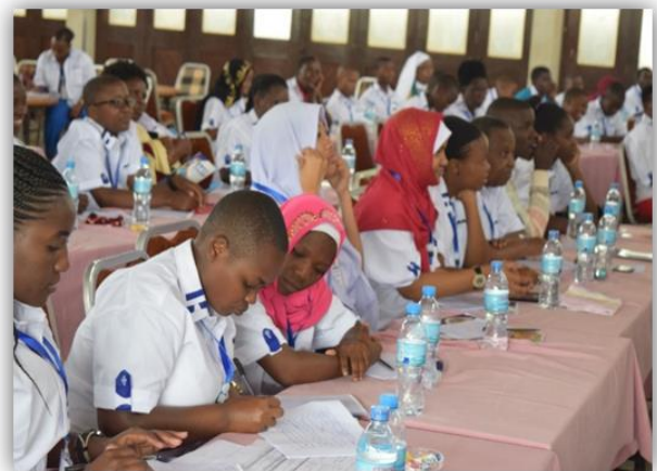
A cross section of beneficiaries attentively taking notes during the workshop.