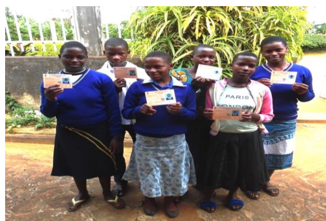
Some of SATF beneficiaries in secondary education, under St.Maria Goreth-Bukoba Rural, displaying their CHF cards.