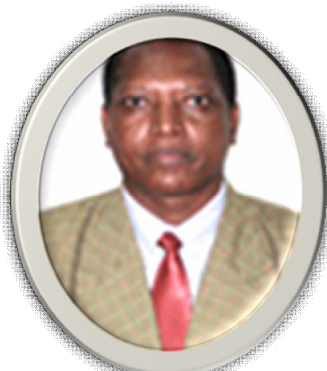
Prof. John Kabudi