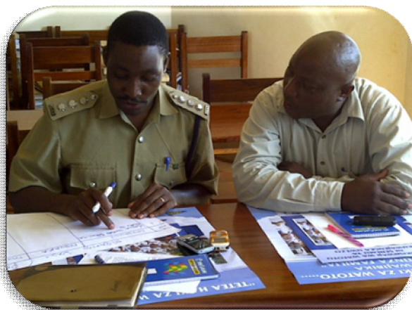
Preparation of PSS mainstreaming work plan by members of Police Department at Lindi Municipality during PSS advocacy meeting