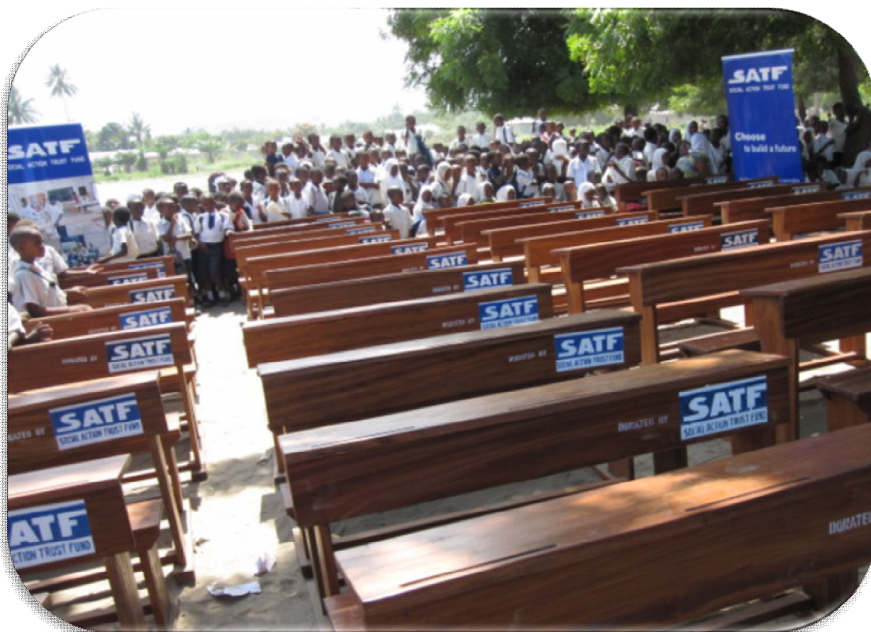
Pupils at Ulongoni Primary School in Gongo la Mboto, Dar es salaam happily looking at the desks donated by SATF in March, 2012