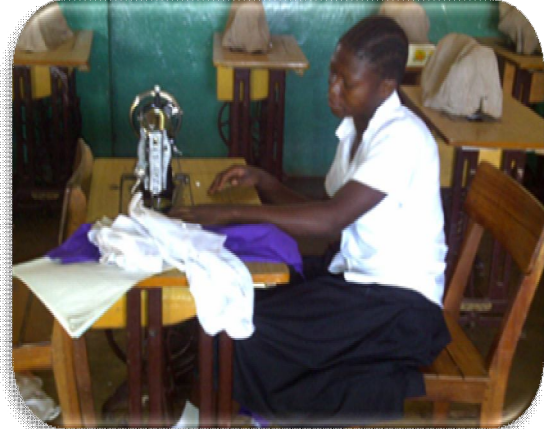
One of the Vocational Training beneficiaries from Lindi who is supported by NAWODA under SATF funding