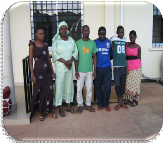
A group photo of VTC students at VETA campus Lindi who are supported by LISAWWE under SATF funding with LISAWWE chairperson