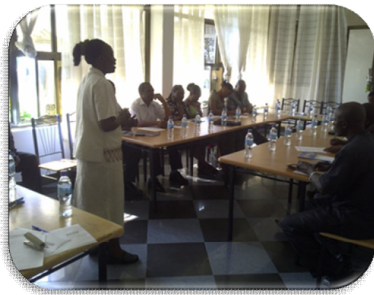
One of PSS TOT participants replicating PSS knowledge and skills to care givers in Dodoma

WOMEN GROUP and FPCT-CHAMWINO from Dodoma region, PADI from Ruvuma region, GROWOYODA and MAPAMBAZUKO from Njombe region and NAWODA and LISAWA from Lindi region. This training was conducted at Wanyama Hotel, Sinza, Dar es Salaam from 19 th March to 23 rd March, 2012 and it was the last training in three years phases. The SATF partner organizations will use the TOTs to train 160 caregivers who are expected to reach 800 MVC with PSS interventions in 8 districts.