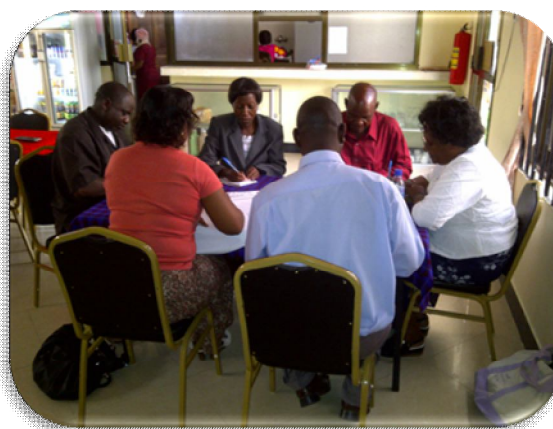
Group discussion during PSS advocacy meeting in Dodoma Municipality