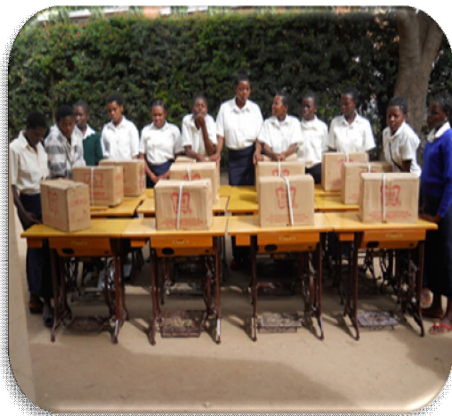
MVC in a group picture during the handover ceremony at TIKVAH homes office in Dodoma Municipality. The beneficiaries were provided with sewing machine as a startup toolkit