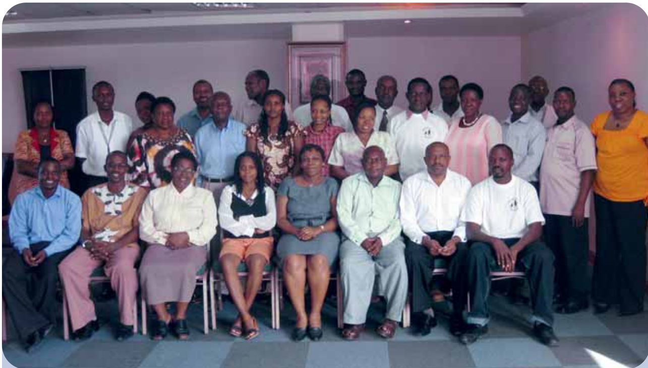
A group of PSS training participants together with SATF team after the closing Ceremony on the 5 th June 2009.

SATF has received grant from The Foundation for Civil Society (FCS) to scale up Psychosocial Capacity Building project in 13 regions. The project builds upon the previous Psychosocial Support project which was implemented in 2008 which was funded by Foundation for Civil Society. The project will be implemented for three years and the total cost of the project is TShs. 317.4m of