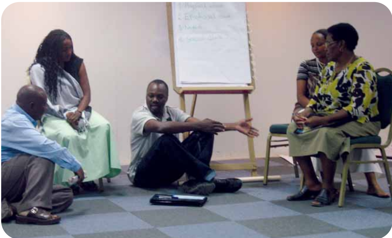
PSS participants during group discussions