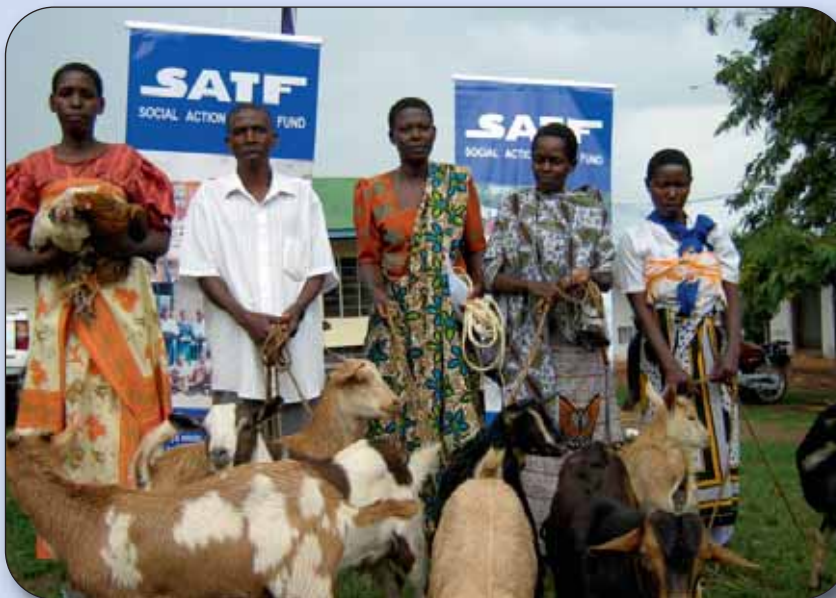
Some of beneficiaries who were supported with livestock under SATF Community Empowerment Project in Kihanga ward, Karagwe.

In order to ensure that, this project is sustainable, beneficiaries were facilitated to form groups of 3 to 6 people. Seven groups were formed by beneficiaries, these are Tupendane Kituntu, Tuinuane Ihanda, Juhudi Nsheshe, Umoja, Tuinuane Katanda, Tweyambe Kishojo and Azimio Keishenyanga. Each group has its leadership which will oversee progress of their respective groups. In addition to that, each beneficiary is required to return 1 goat and 2 hens after a year. This will enable other Caregivers to benefit from the project. The beneficiaries were also trained on record keeping and encouraged to nurture the saving culture for proceeds from their sales. The project is expected to scale up and to reach 15 more beneficiaries after one year.