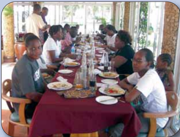
➔ SATF staff together with Children and representatives from YOPAC and Upendo Development Group having lunch at Kunduchi beach hotel during the office year-end event.