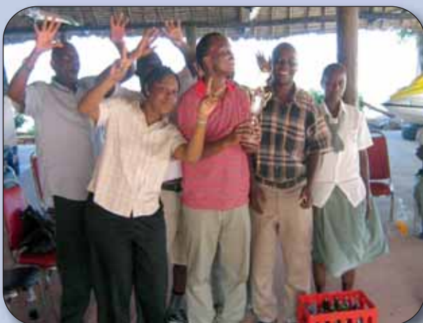
➔ Representatives of SATF sponsored children, YOPAC and Upendo Development Group staff in group picture during year-end event at Kunduchi beach Hotel