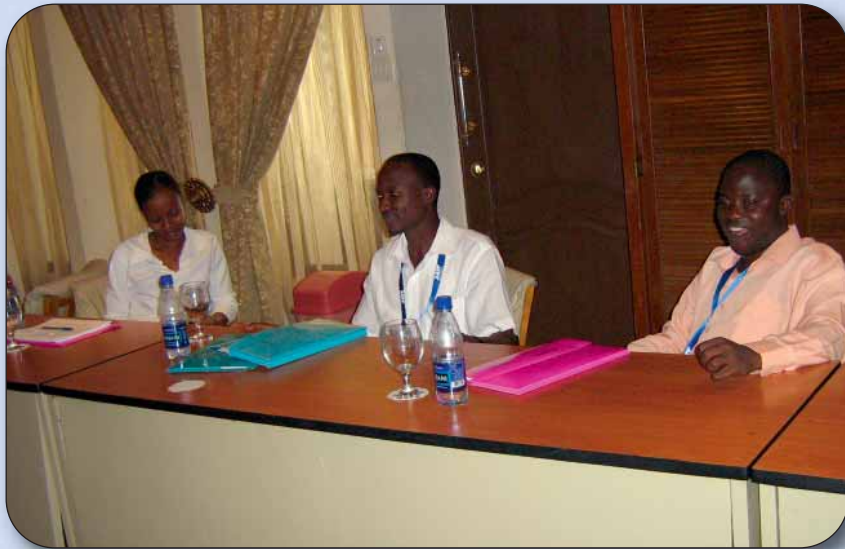
A cross section of SATF staff during the retreat workshop at Kunduchi Beach Hotel, Dar es Salaam

In July 2009, SATF conducted a Retreat workshop at Kunduchi Beach Hotel. The objective of the workshop was to review the progress of the implementation of the Strategic Plan 2008/2010 and to discuss on the way forward. The workshop was attended by Trustees and all Staff members. The facilitator of the workshop was Mr. Paschal Lutege from Chater Consult firm.